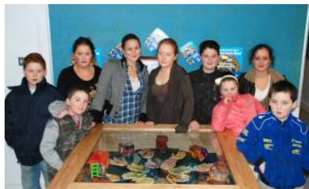
Travelling Community Children

The cartwheel was located in the College's Springtown Centre because the Centre is "trade" related; a view with which members of the travelling community perceive their own culture.