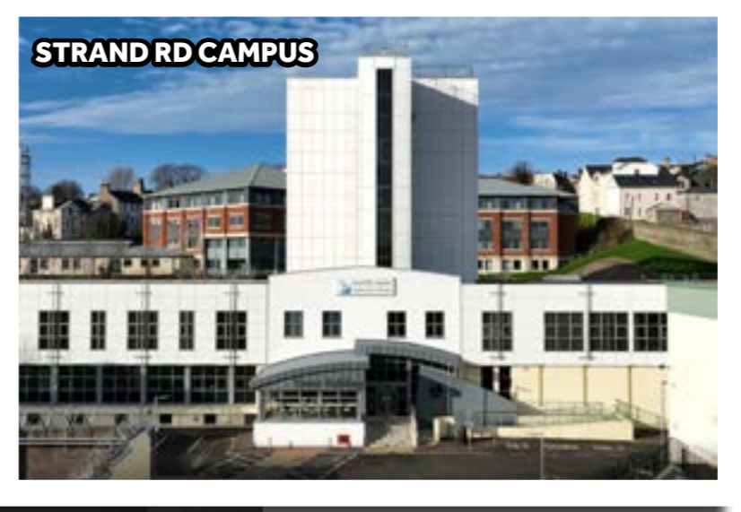
STRAND RD CAMPUS